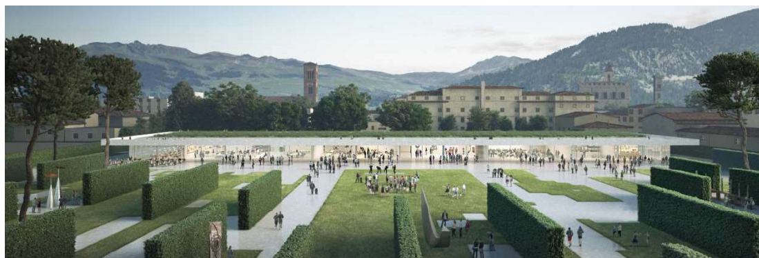
Figure 2. Project rendering of Prato Central Park